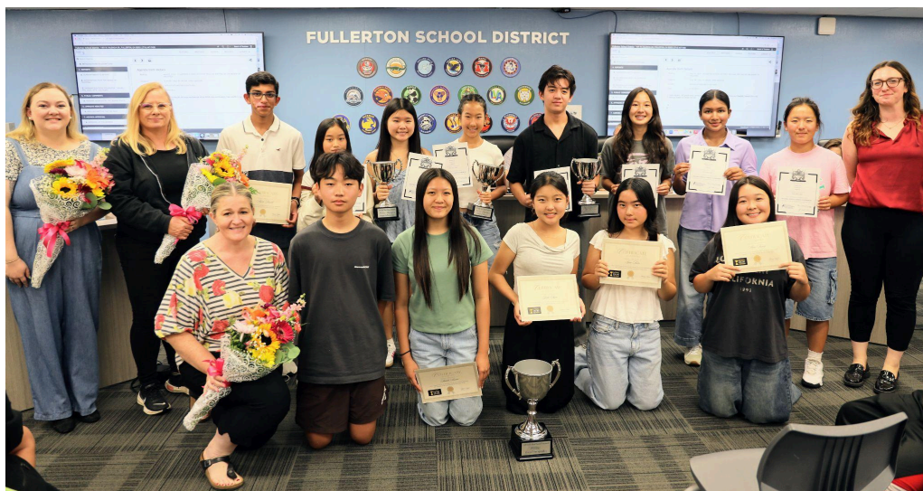
Parks Junior High has earned the title of Overall School of Excellence for five years in a row.