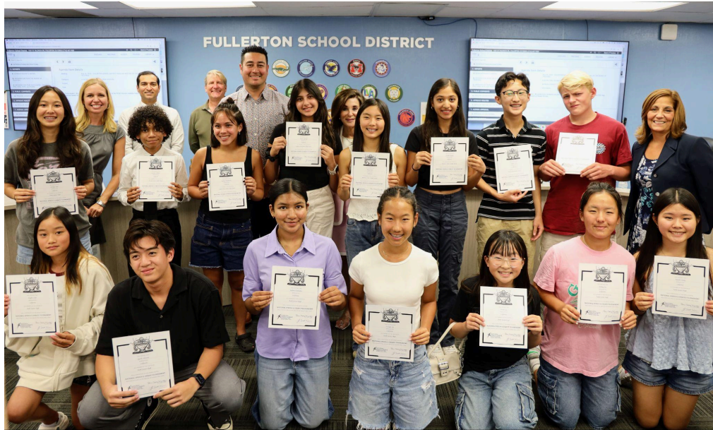
FSD’s Board of Trustees invited all 20 of its national speech and debate competitors for board recognition at its Aug. 20 board meeting.